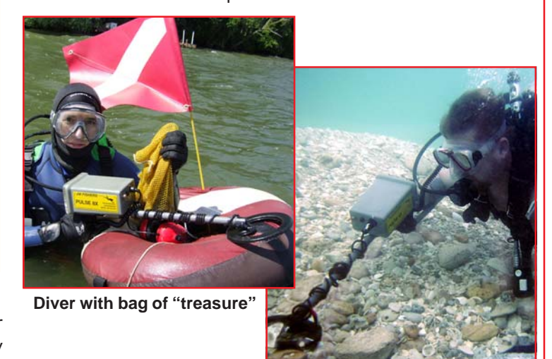
Working a wreck site

When the transmitted pulse hits a metal object, an electro-magnetic field is induced in the object. This causes eddy currents to flow in the metal, which in turn generates a second electro-magnetic field. This field is picked up by the coil and then displayed by the meter and heard in the earphones.