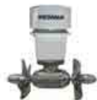
DC Pro Thrusters

WESMAR also manufactures a full line of Searchlight sonar, Trawl sonar, Bow and Stern Thrusters for yachts and sportfishing, and Auxiliary Propulsion (Get-Home) System.