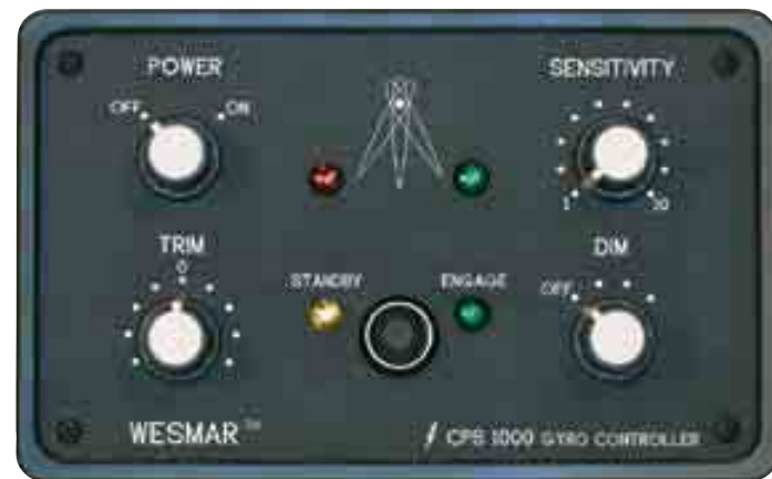
CPS 1000 Electronic Gyro Console

WESMAR's electronic gyro system samples at 1000 times per second delivering lightning speed reaction for exceptional performance. The electronic gyro sensor sends information about roll velocity and acceleration directly to WESMAR's proportional valves, which react instantaneously to rotate the fins. When a desired lift is achieved to counteract the rolling force of a wave, WESMAR's closed proportional hydraulic system instantly interacts with the electronic gyro to correct the rolling. This coordinated response stabilizes the vessel immediately.