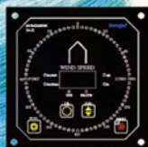
AM-100D Indicator Unit