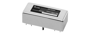
FL-100 CW/FSK NARROW FILTER

Provide better CW/RTTY reception. Bandwidth: 500 Hz/–6 dB