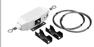
MN-100 ANTENNA MATCHER

Matches the transceiver to a dipole antenna. Covers all HF bands from 1.5 to 30 MHz. 8 m × 2 antenna wires come attached.