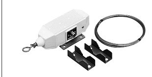
MN-100L ANTENNA MATCHER

Match the transceiver to a long wire antenna. Covers all HF bands from 1.5 to 30 MHz. 15 m × 1 antenna wire comes attached.